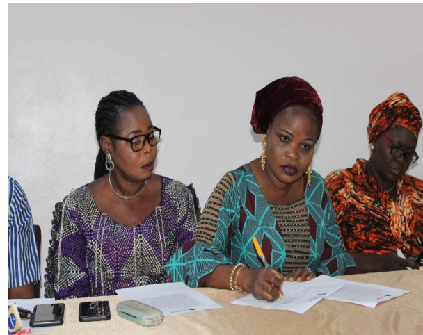
Figure 7-10: Representatives from the Oyo State LGA