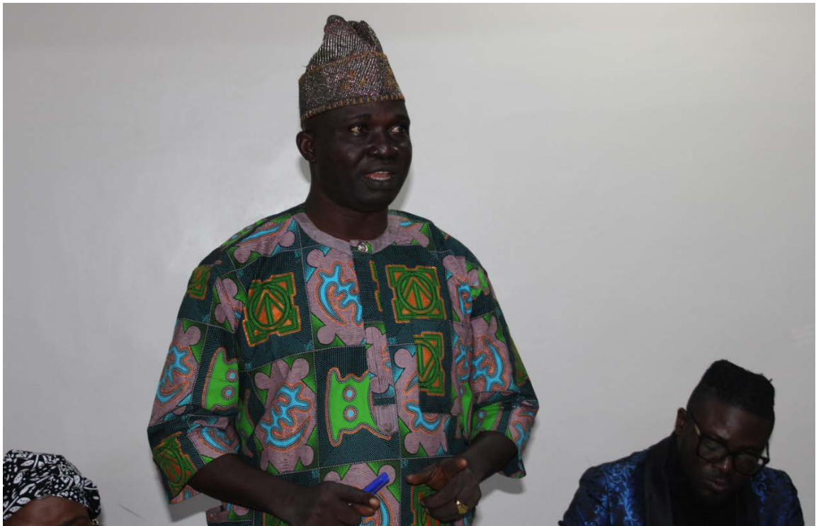
Figure 5 A representative from Itamerin market