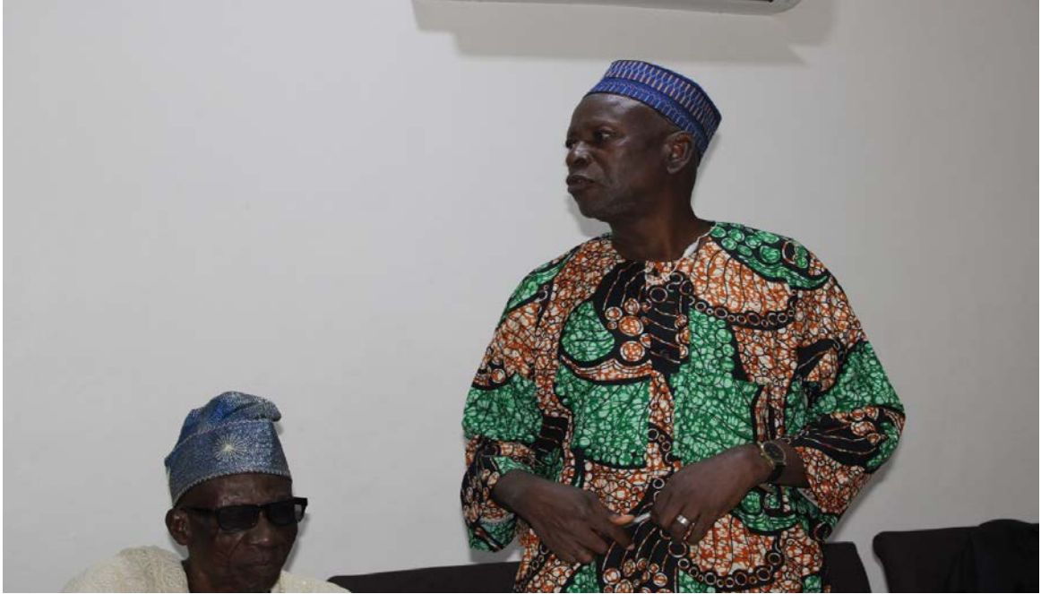
Figure 4 A representative from Shasha market