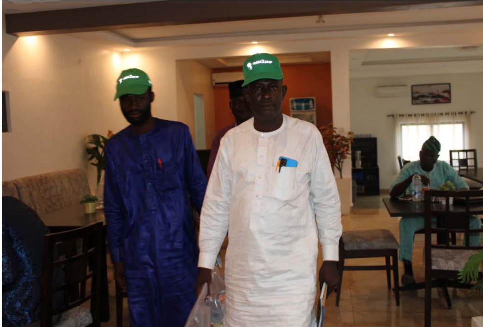
Figure 6 Representatives from Rahama market