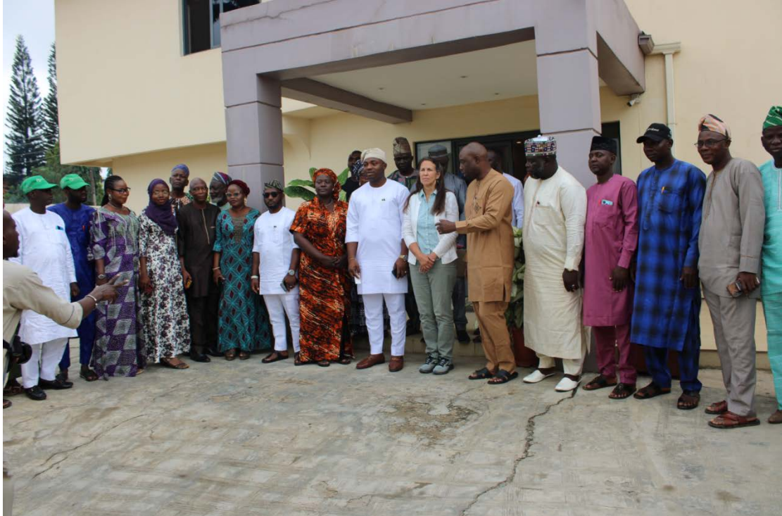
Figure 11: Participants with the chairman for Ibadan North LGA