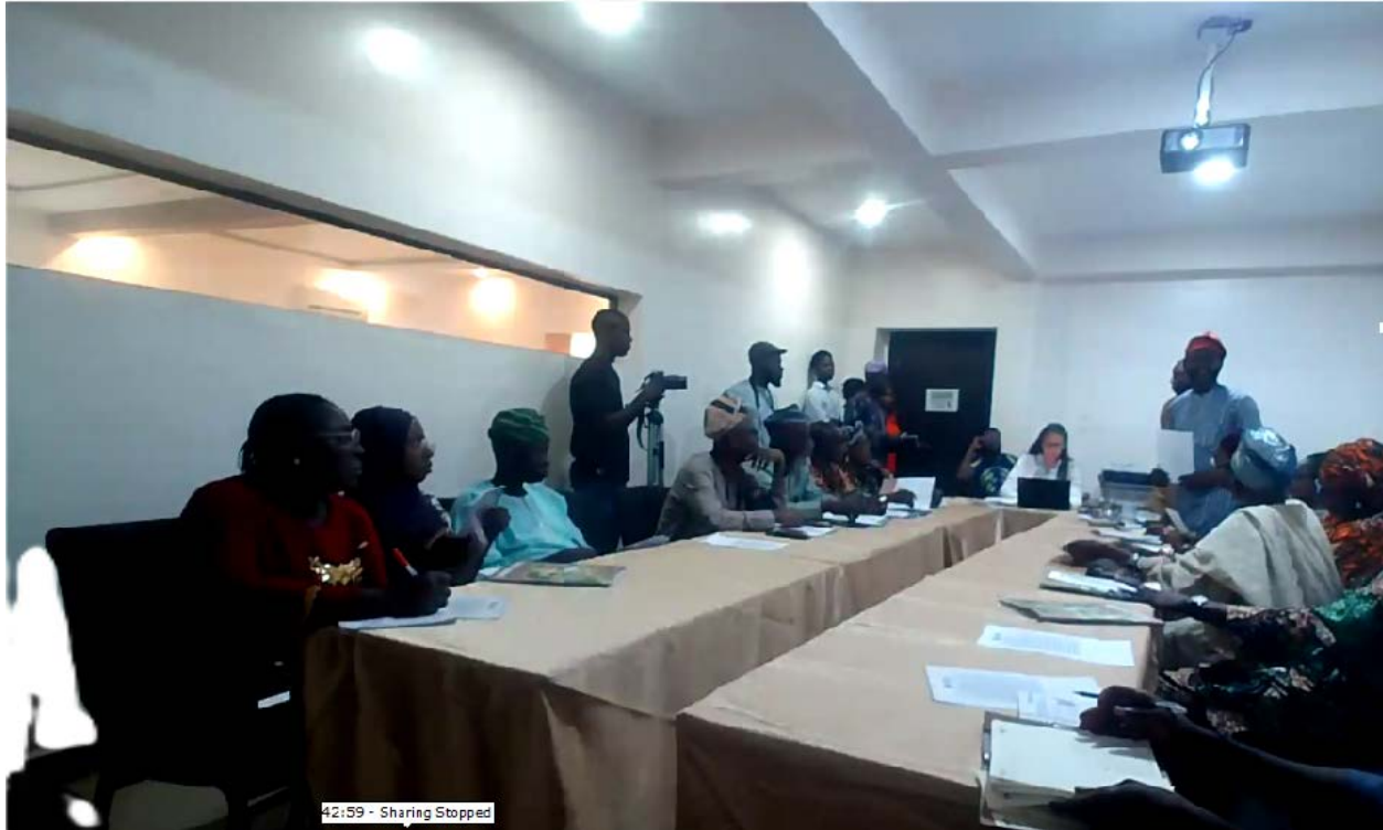
Figure 2a: in-person participants